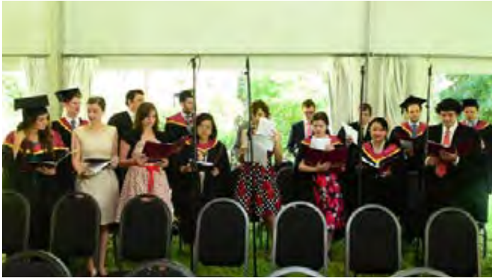
The College Schola rehearsing prior to the Graduation Mass