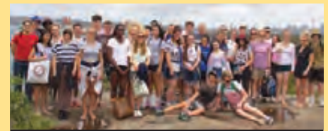
Students on one of the outdoor excursions in Campion's Summer Week.

Campion's latest Summer Week for senior school students, held in mid-January, attracted more than 40 participants – the largest number since the program was launched in 2011.