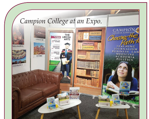
Campion College at an Expo.