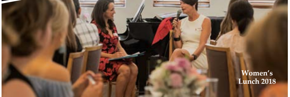
Women's Lunch 2018