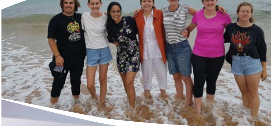
Summer Program 2018