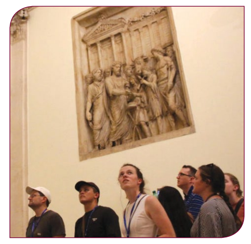
Campion College Rome School participants visiting Capitoline Museum in Rome.

The learning we received during the lectures enhanced our touring experience, allowing us to further appreciate the historical sights we visited, bringing to life all that we were studying.