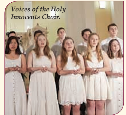
Voices of the Holy Innocents Choir.

During August and September, a group of students at Campion, along with outside members, were involved in the Voices of the Holy Innocents Choir. This choir was formed to sing the famous Coventry Carol at Central Station back in early August, during the Parliamentary Abortion Bill Debate.