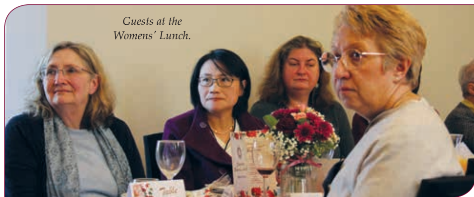
Guests at the Womens' Lunch.