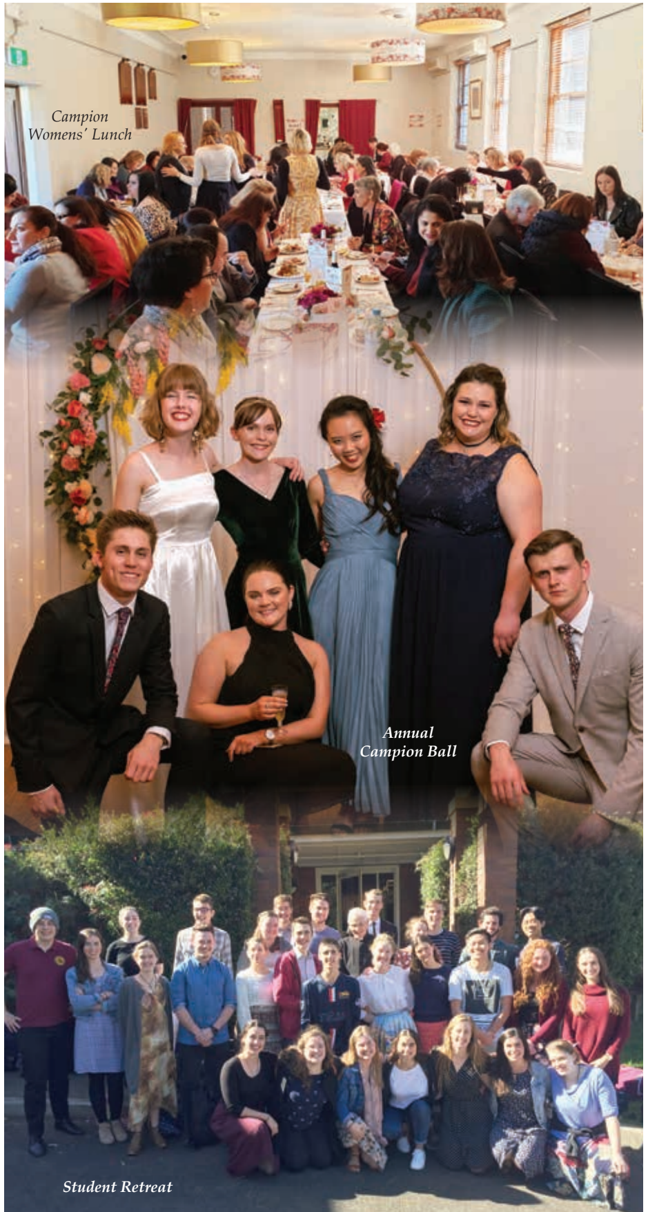
Campion Womens' Lunch

PO Box 3052, Toongabbie East, NSW 2146 8-14 Austin-Woodbury Place, Old Toongabbie, NSW 2146 Australia Phone 1300 792 747, Fax (02) 9631 9200 foundation@campion.edu.au www.campion.edu.au/the-foundation