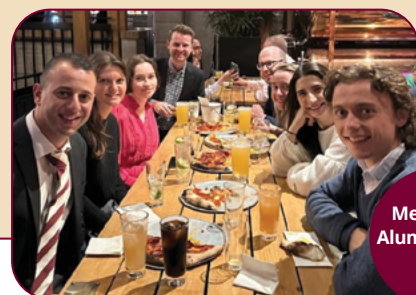
Melbourne Alumni Drinks Night

Since graduating from Campion in 2019, I’ve had the opportunity to pursue various paths in work, travel, and volunteering. In each endeavour, the knowledge and formation in reasoned thought which I received at Campion have given great benefits. Currently, I’m undertaking a Master of Occupational Therapy at the University of Sydney, and the academic rigour instilled by Campion is proving invaluable. Campion helped develop my critical thinking ability, which has enabled me to bring both creativity and a broad historical understanding of society to my current degree. Academic study, Faith formation, and the friendships the College enabled me to receive still forms the fabric of my life, three years after graduating.