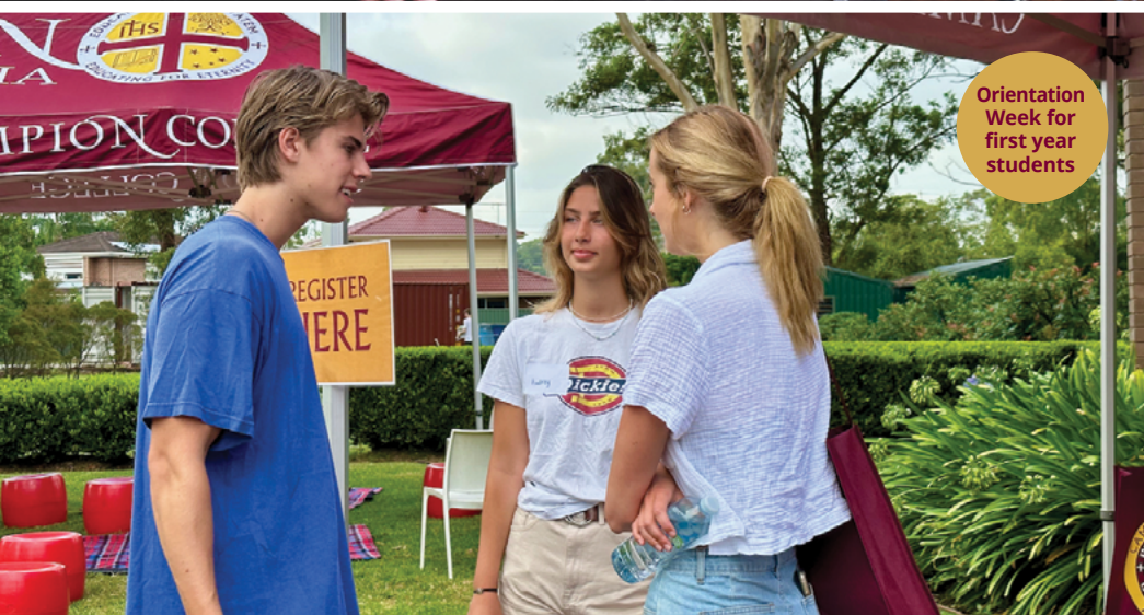
Orientation Week for first year students