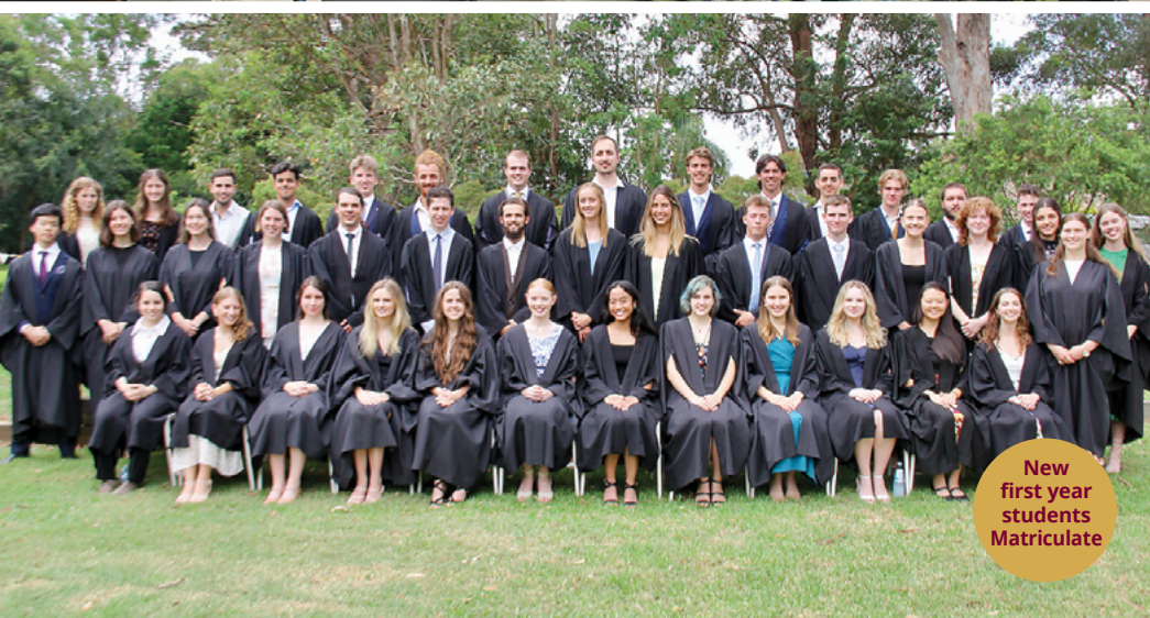
New first year students Matriculate