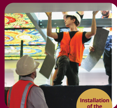
Installation of the Skylight

To learn more on how to support the Capital Appeal visit: www.champion.edu.au/foundation/capital-appeal