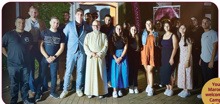
Young Maronites welcomed at Campion College