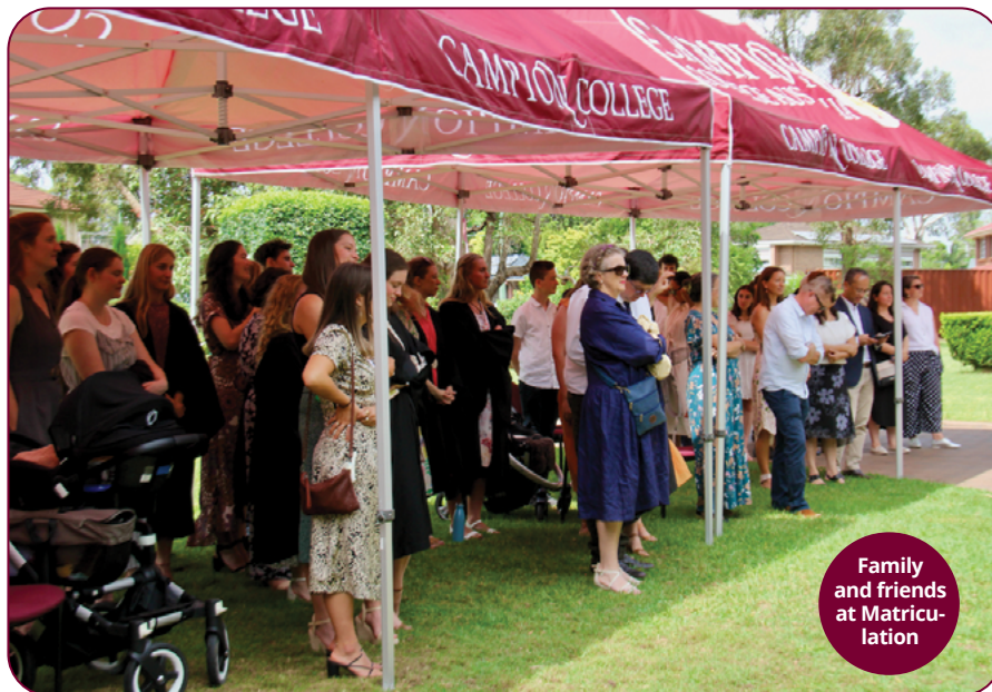
Family and friends at Matriculation