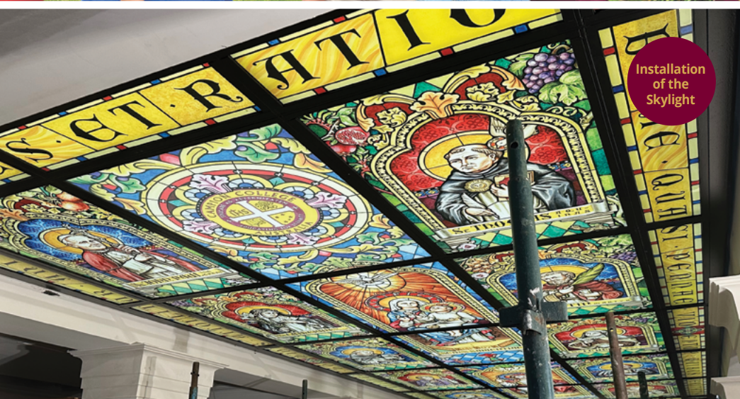
Installation of the Skylight