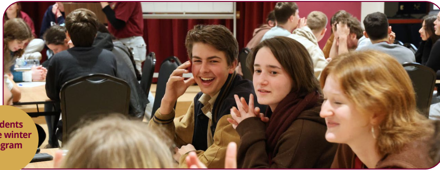
Students at the winter program

Campion College has recently concluded its highly successful 2023 Winter Program, which marked the college's biggest-ever program in terms of participant numbers. With an impressive turnout of 76 participants, the program attracted students from five different Australian states, as well as two enthusiastic attendees from New Zealand.