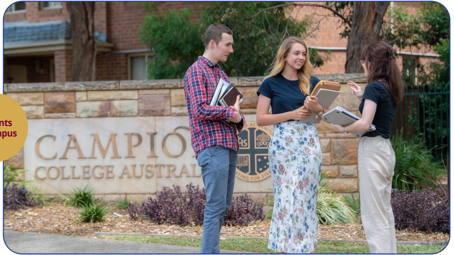
Students on Campus

We are often asked why someone should support Campion College's Regular Giving Campaign.