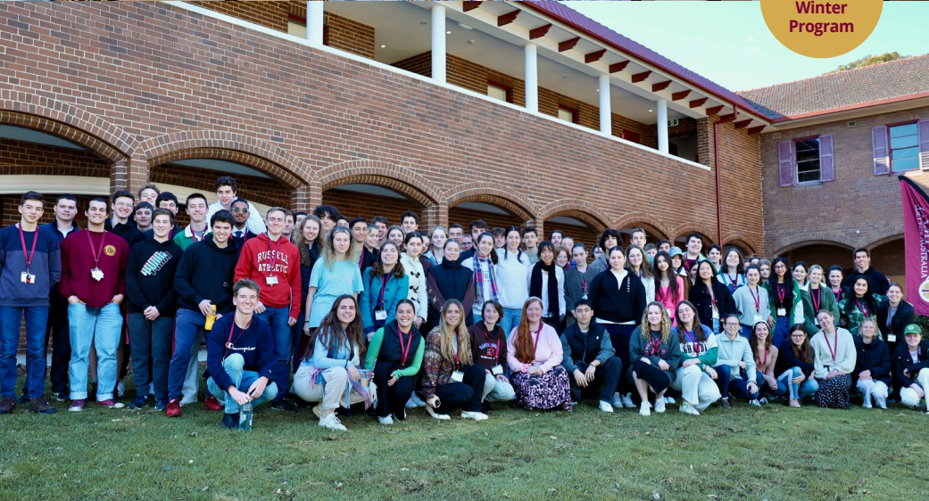
Campion's biggest ever Winter Program