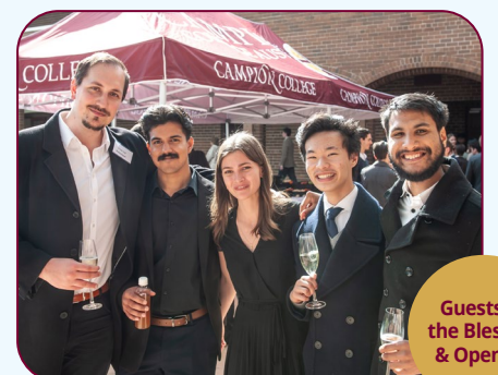
Guests at the Blessing & Opening