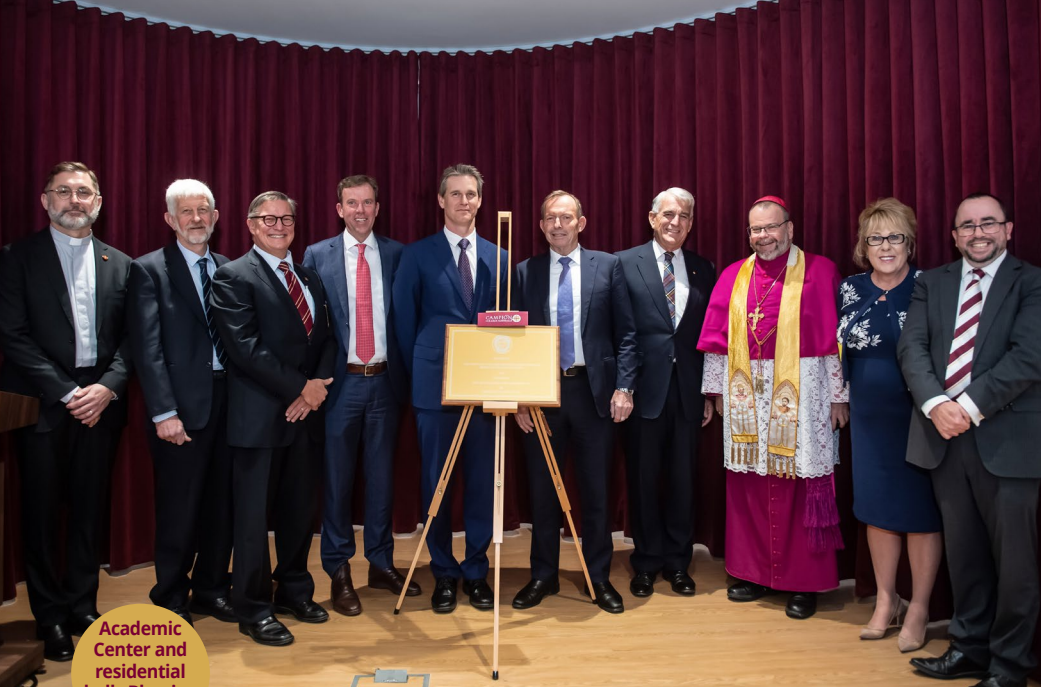
Academic Center and residential halls Blessing & Opening