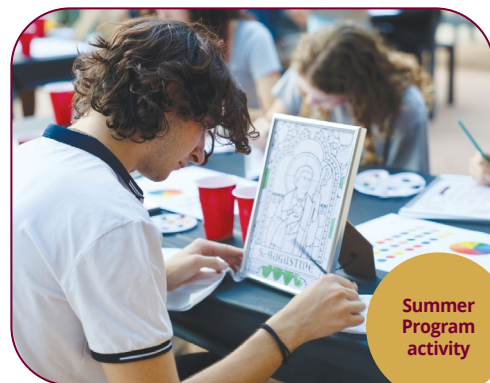
Summer Program activity