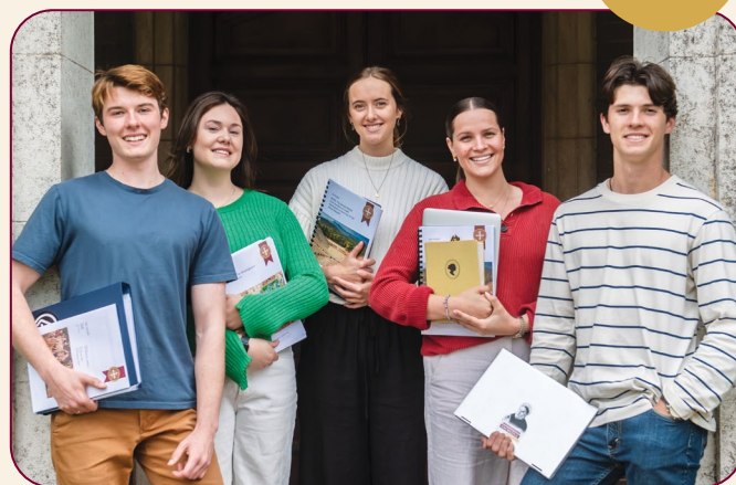
Students on campus

The College encourages students to participate in the Awards and Prizes Program. For many this is a chance to showcase their learning and share their thoughts.