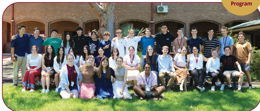
Group photo 16-19 Jan 2024 - Summer Program