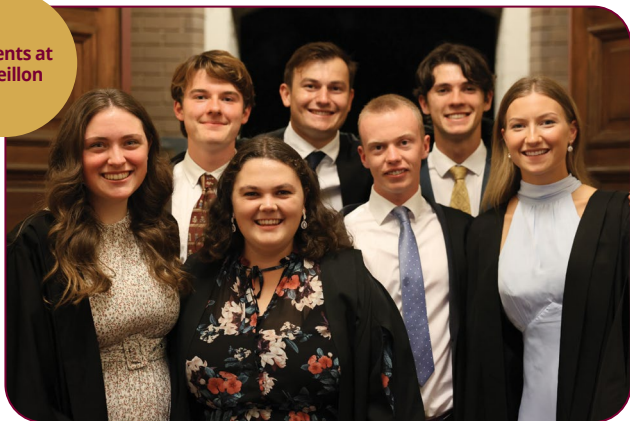
Students at Reveillon

Another academic year came to an end as Campion celebrated its annual Reveillon dinner on Thursday 23 November 2023.