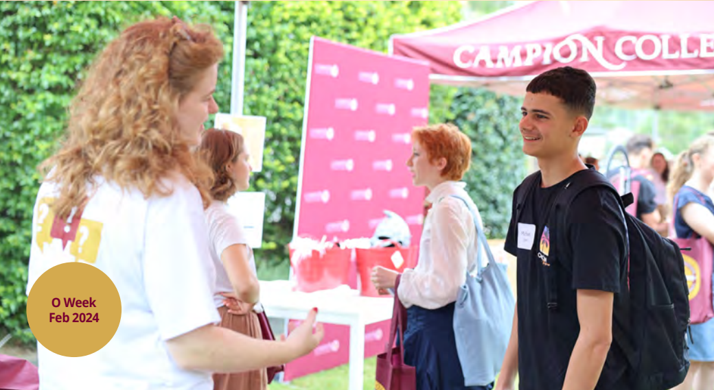
O Week Feb 2024