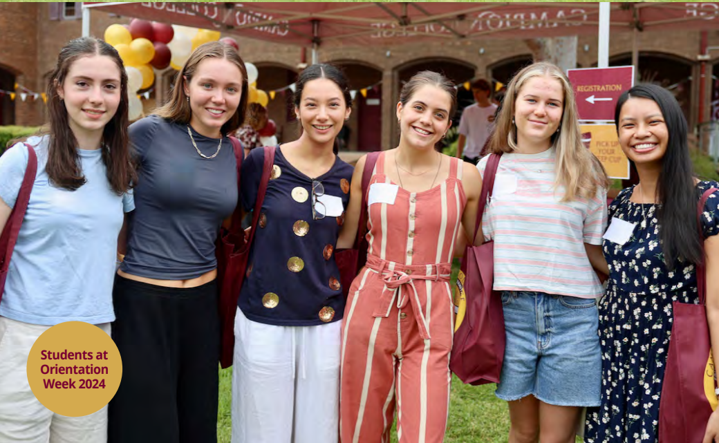
Students at Orientation Week 2024