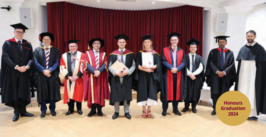
Honours Graduation 2024