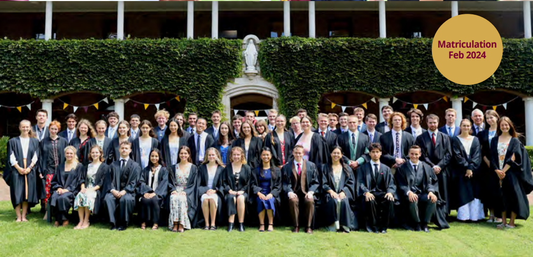
Matriculation Feb 2024