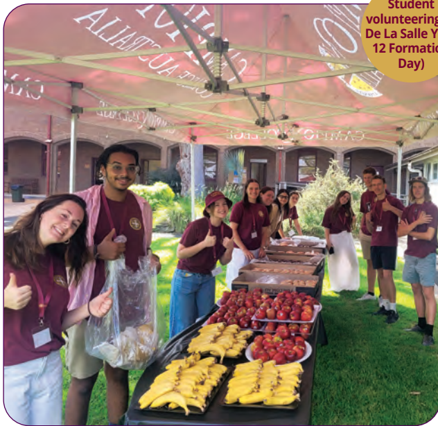
Student volunteering at De La Salle Year 12 Formation Day)