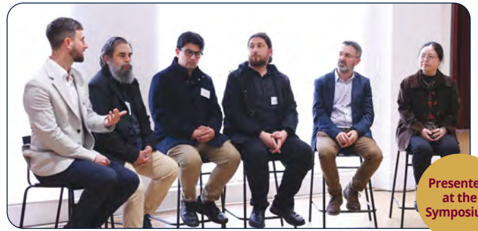
Presenters at the Symposium