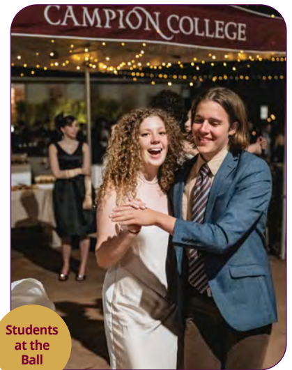
Students at the Ball

For the full article and photos, visit https://www.campion.edu.au/hollywood-elegance-takes-centre-stage-at-annual-campion-ball/