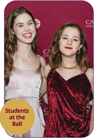
Students at the Ball

The Annual Campion Ball, held on September 14, celebrated "The Golden Age of Hollywood" with over 350 attendees enjoying a glamorous evening. Guests donned stunning attire, capturing memories on the red carpet, while the Grand Hall was transformed into a sophisticated ballroom for traditional dancing.