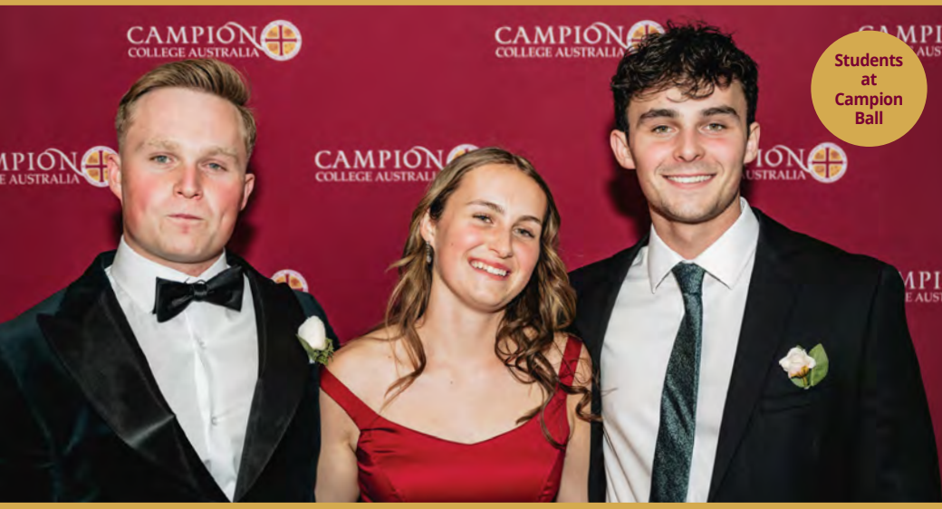
Students at Campion Ball