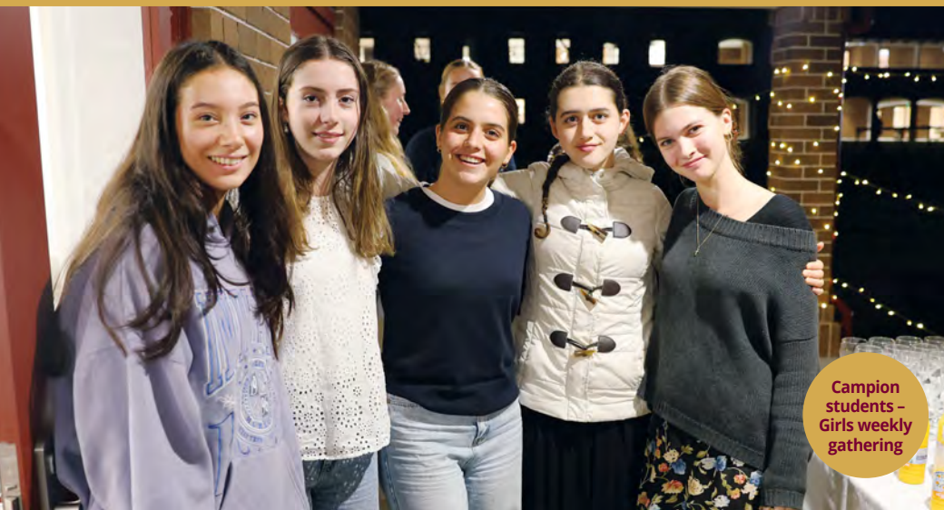
Campion students - Girls weekly gathering