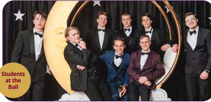
Students at the Ball