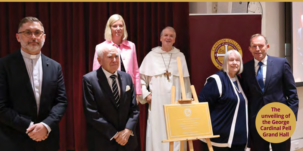
The unveiling of the George Cardinal Pell Grand Hall