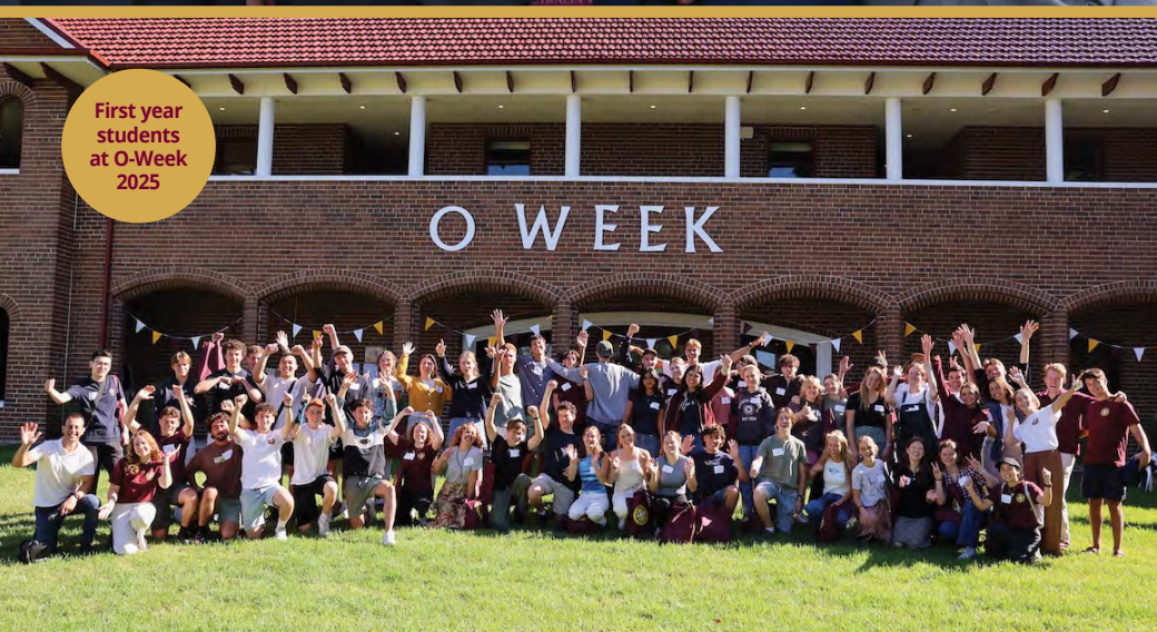
First year students at O-Week 2025