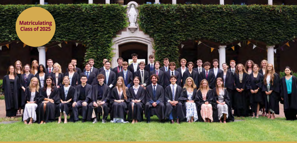
Matriculating Class of 2025