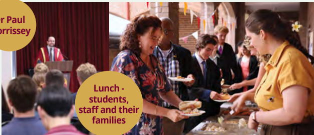
Lunch - students, staff and their families

Campion College formally welcomed its newest cohort of students on Monday, 23 February, marking the commencement of the 2026 academic year.